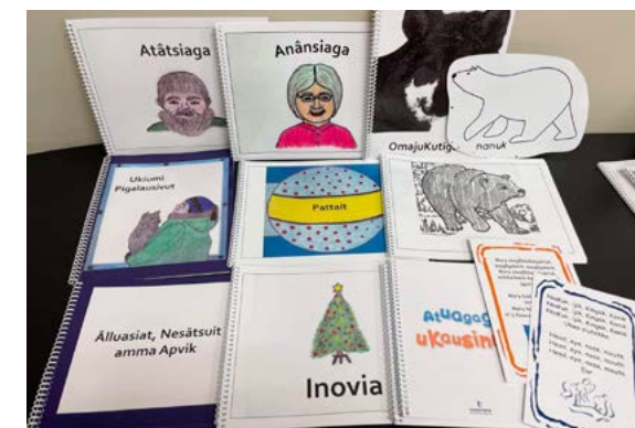
The Inuit Home Childcare Resource Kits provide a creative way for children to engage with their culture and language

Kit was distributed to families in all Labrador Inuit communities.