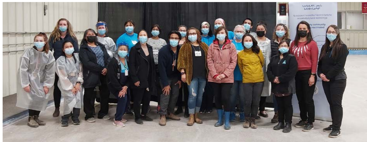
We are proud that Nunatsiavut nurses could assist other communities when needed