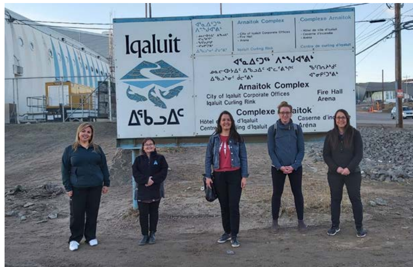
The nurses' trip was a great exchange between communities in Nunatsiavut and Nunavut

“We were very proud to be able to assist health officials in Iqaluit...”