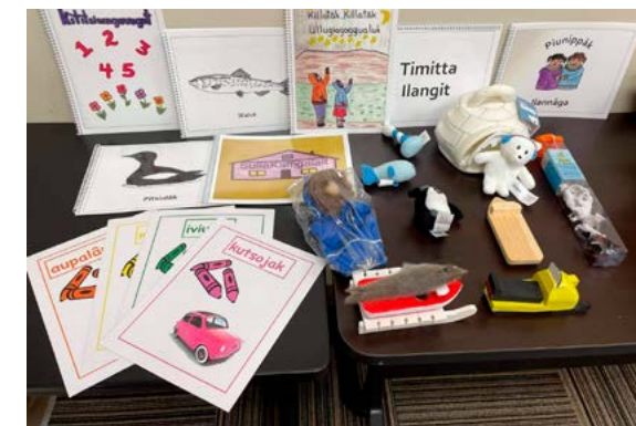
The kits are designed according to age group with age-appropriate resources in each it