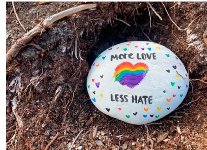
Pride themed rock painting in Postville was an opportunity to learn about the meaning of Pride Nain's first ever Pride walk was a great success that will continue in years to come